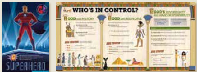
G2R Student Bible Studies (trifold)