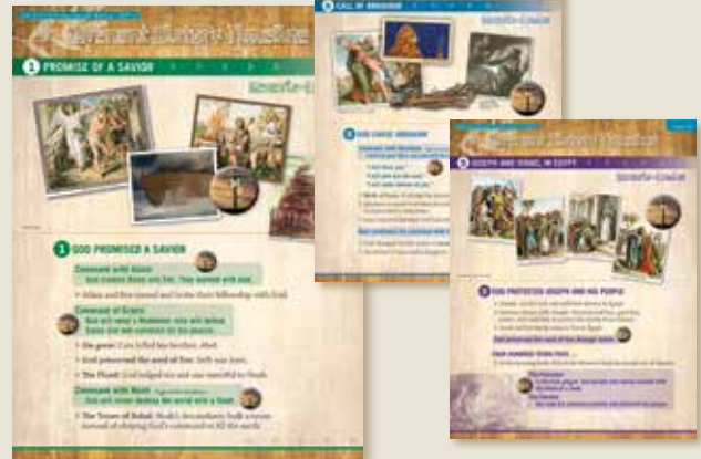
Covenant History Timelines