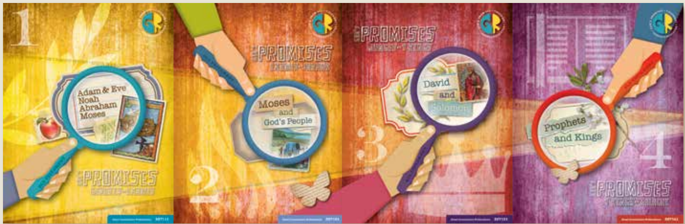
Old Testament Leader's Guides