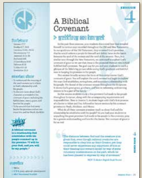
Leader's Guide Page