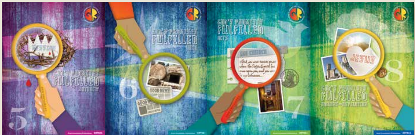
New Testament Leader's Guides