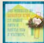
Social media digital downloads