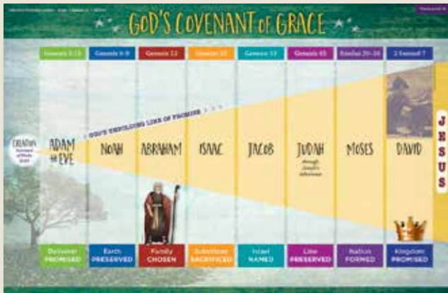
Covenant of Grace Poster